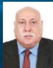
Honorable Judge Mustafa Al Sharqawi Judge at the Dubai Supreme Court